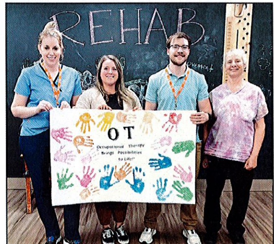
Slate Valley Center's occupational therapy staff with the poster created by the center's residents in celebration of Occupational Therapy Month.

At Slate Valley Center, nearly 44% of the residents are at or above an expected ability to move about at the time of discharge, versus the national average of 40%. Also, almost 18% of the residents see a change in their ability to move, versus the national average of a little over 16½%.